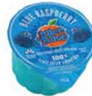
JACup1001 Blue Raspberry GTIN: 10854484005009