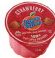
JACup1010 Strawberry GTIN: 10854484005016