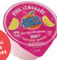
JACup4006 Pink Lemonade GTIN: 10854484005351