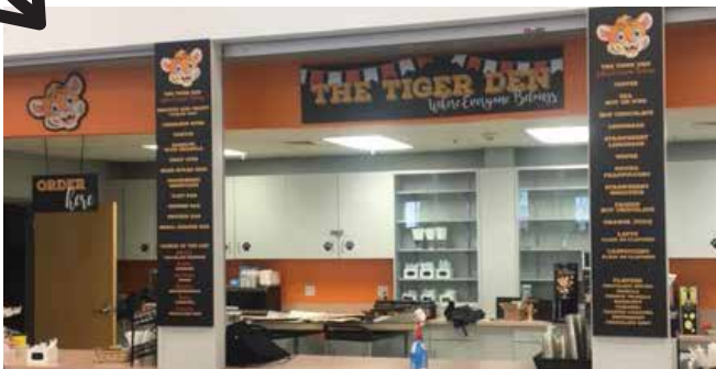
Custom Graphic Examples