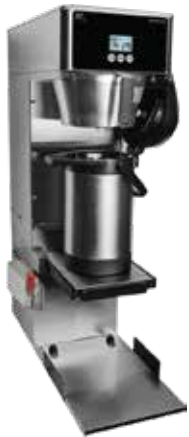
Coffee Brewers and Servers