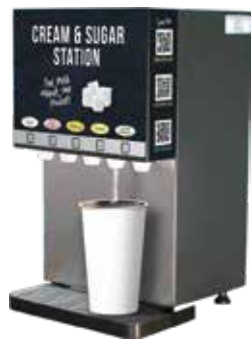
Creamer and Sugar Dispensers