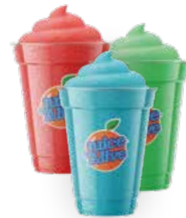
Cups are available for purchase.