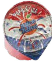
JACup1040 Poppin' Ice GTIN: 00854484005248