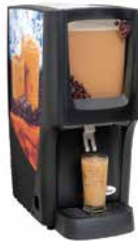
Cold Drink Dispensers